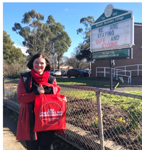
Lisa Chesters M.P. with her donation of books